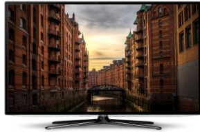
Any TV Set