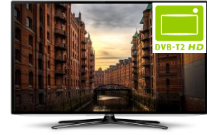
Connected Devices optionally